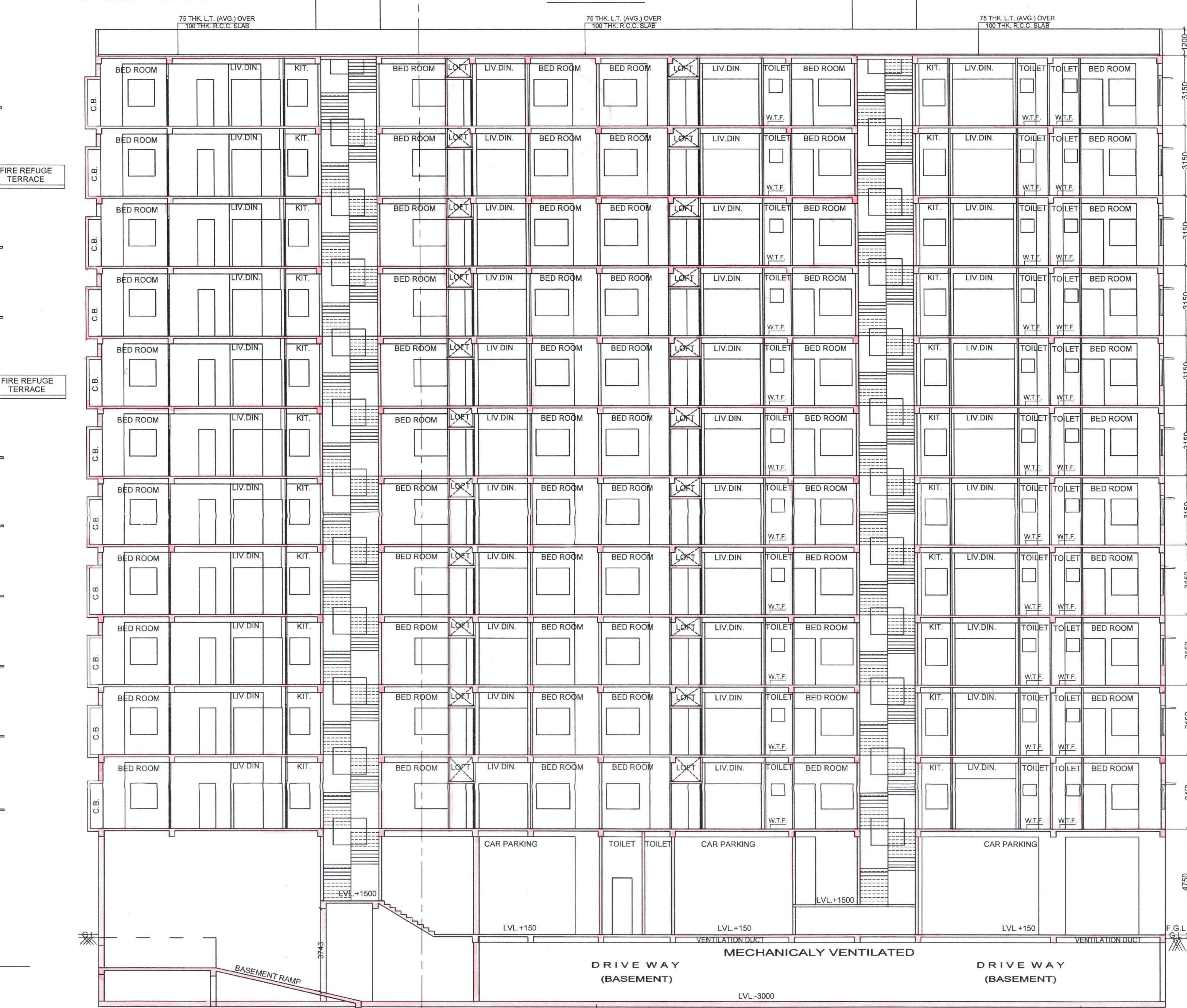
SECTION ON A-A